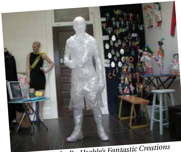
One of Ruby Re-Usable's Fantastic Creations

Museum of Glass Tacoma Art Museum Washington State History Museum Chihuly Bridge of Glass Union Station Outdoor Sculptures & Architecture